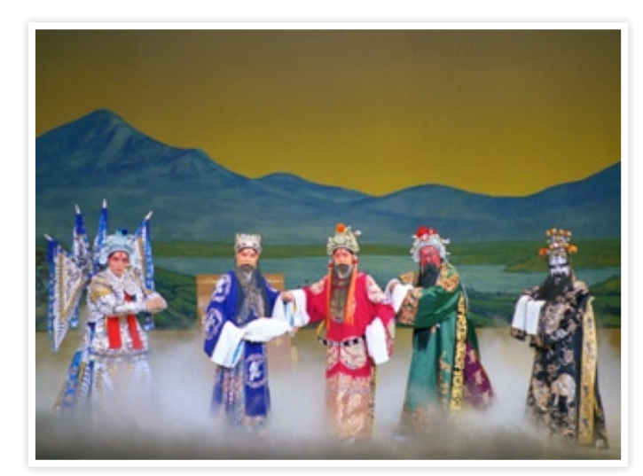
Premiere of Romance of the Three Kingdoms in Japan by the China Peking Opera Theater in 2006