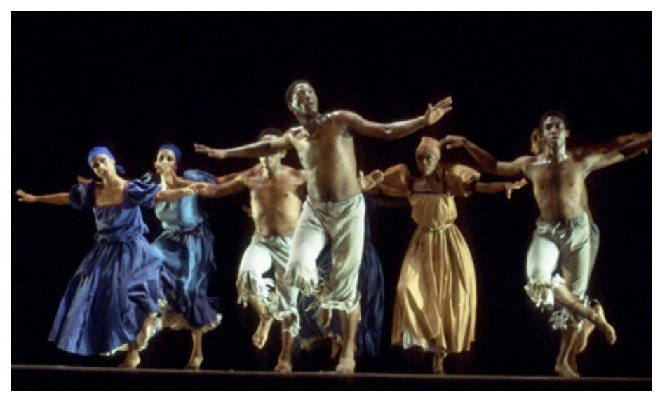
Performance of Conjunto Folklórico Nacional de Cuba in Tokyo in 1993

Min-On: Cuban music is hugely popular—many wonderful Cuban artists have been influential