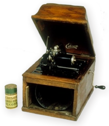
Edison Ambelora Model 30 with a cylinder record