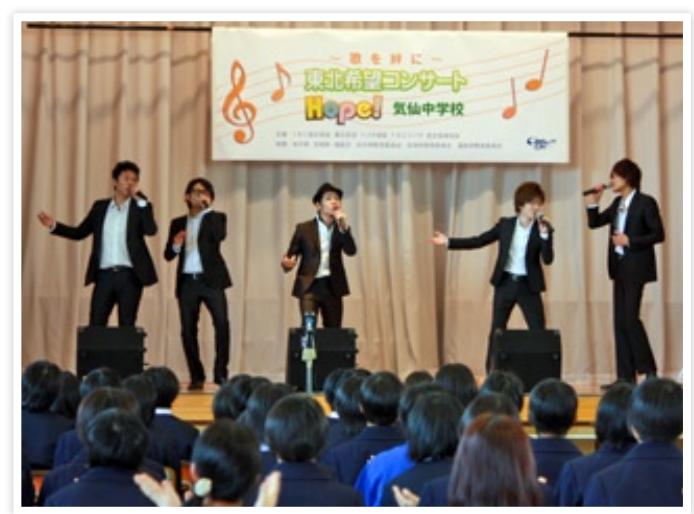
The Tohoku Hope Concert by a cappella group INSPi at Kesen Junior High School in 2012