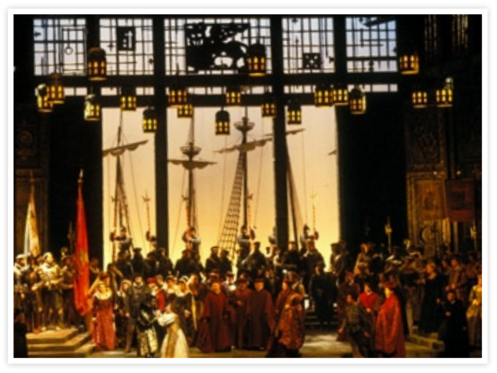
Otello by La Scala (Teatro alla Scala) in Japan 1981