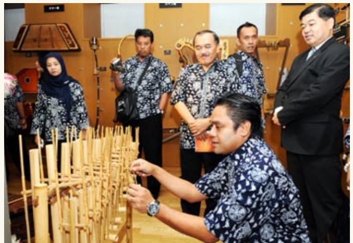
A member of institute plays an Indonesian Angklung on display in the Music Museum

After enjoying a tour of the Min-On Music Museum, the delegation visited the Soka University in Hachioji and held a Japan-Indonesia goodwill concert with performances of ethnic music and traditional dance at the student center on the campus. After the performance, the Institute bestowed "The Highest Commendation for an Honorable Cultural Figure" upon Min-On founder Daisaku Ikeda in honor of his