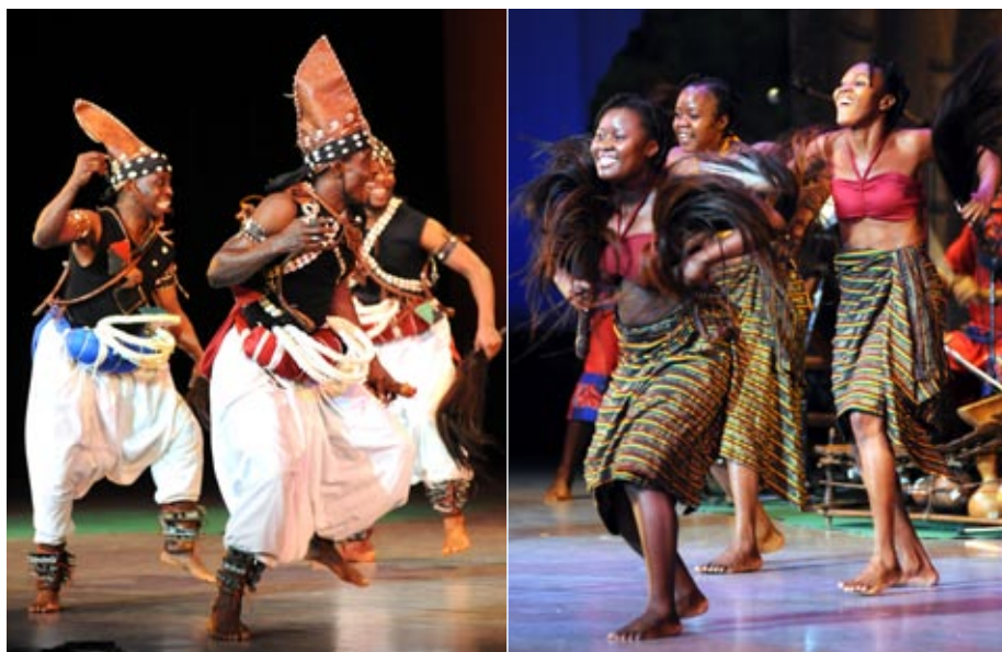
Left: Young men energetically dance Jira ; Right: Atsea is a popular dance at social events for young people

Ambassador: I can confidently say that cultural exchanges are very significant for any country. The Min-On Concert Association has proven this significance by consistently being involved over a long period in concert activities that include various fields of the performing arts, and at the same time the Association has organized countless cultural exchanges with many different countries. Min-On even sponsors whole tours from beginning to end, such as this one for the Ghana Dance Ensemble. It is for us—especially as we have come all the way from Africa—very significant to be able to introduce African culture to Japanese people, and obviously it is beneficial for our country to increase understanding of Ghana in Japan. I have monitored the progress of this tour so as to look after the members of the Dance Ensemble during their visit to Japan, and have found that everybody in the troupe is very happy and appreciative of the kind way