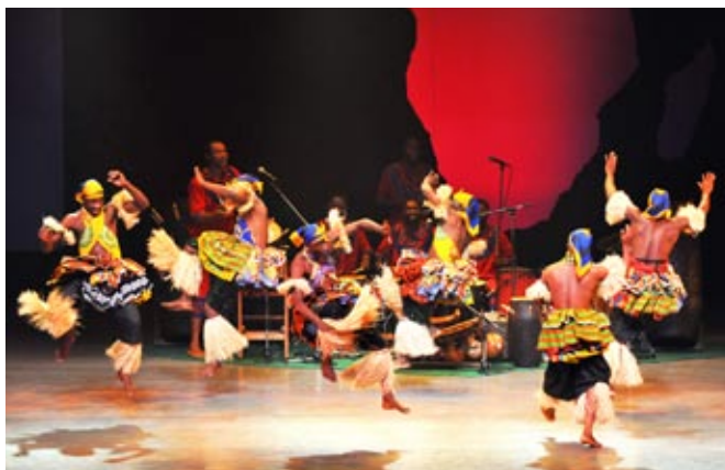
Adzogbo , a medley of music and dance from the neighboring country of Benin, performed by Ghana Dance Ensemble

I deeply appreciate how each member of the Ghana Dance Ensemble has made the long trip from Ghana to Tokyo to deliver uplifting,