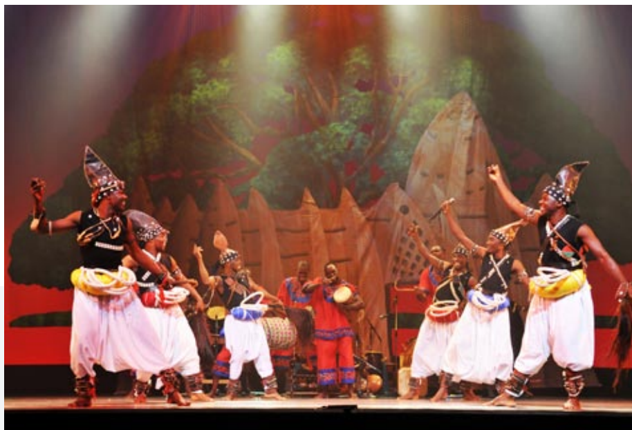
Jira —a traditional dance of hunters from the Northern Region

At a commemorative reception held immediately after the performance, the ambassadors and distinguished guests from various countries, together with the members of the Ghana Dance Ensemble, celebrated the magnificent cultural flowers that bloomed onstage for the African Century.