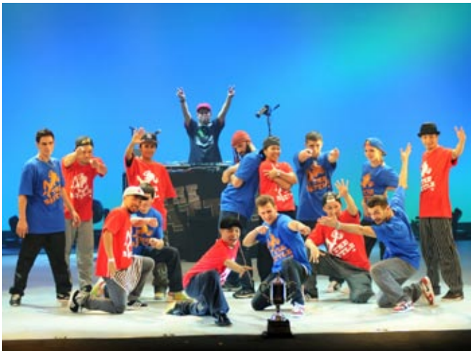
Members of 'The Battle' from Russia and Japan

Street dancing—commonly known as hip-hop dancing or breakdancing—has been a mainstay of modern urban culture since the end of the 20 th century. In the 1970s, a variety of freestyle dancing evolved on the streets of New York City, and