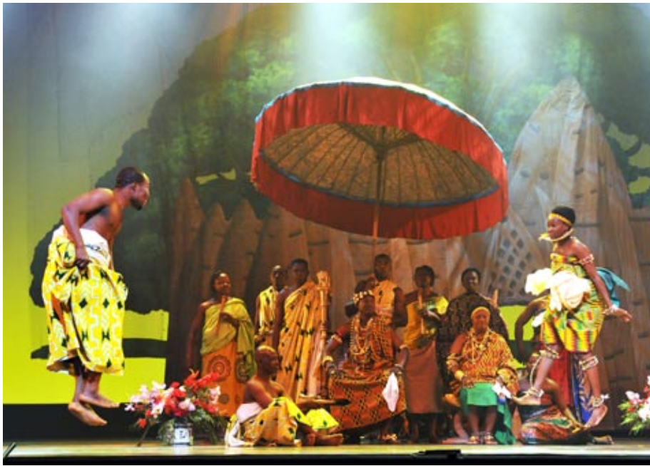
Ahengoro—a ceremonial dance of the ethnic Akans

A Musical Voyage Across Africa is a concert series initiated by the Min-On Concert Association in 1999 and based on the idea that the 21 st century shall be the 'Century of Africa'. Aiming to develop friendships with various African countries and contributing to the realization of the African Century, Min-On has to date introduced and celebrated a variety of rich musical cultures unique to the countries of Africa, each of which has its own distinctive ethnic and tribal heritage of songs and dances.