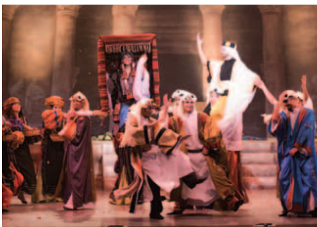
The finale of the Japan premiere of "Bride"

For this Japan premiere of Bride , we newly choreographed the first portion of the performance. I feel that Jordanian folk dance is being reborn and revived through these performances in Japan. That is to say, I think these performances have provided the opportunity to injecting new energy into and restoring Jordanian music and choreography. The costumes were also newly designed and produced.