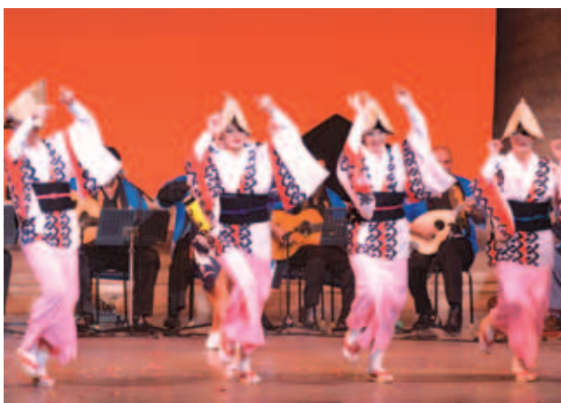
Dancers clad in yukata dress performing a traditional Japanese awaodori dance.