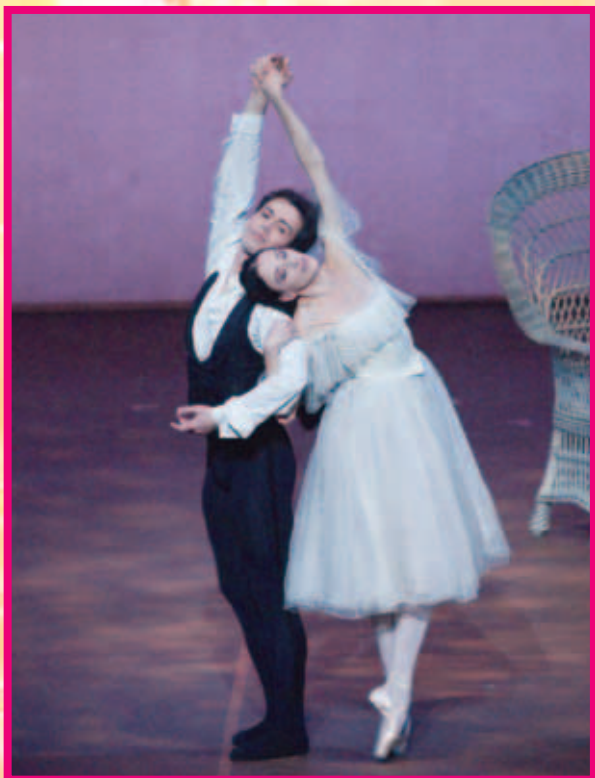
"Lady of the Camellias"