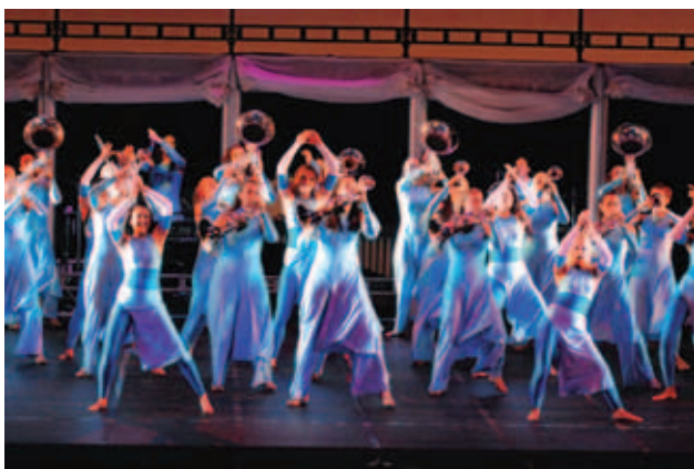
The roar of brass—a vigorous performance full of boundless power