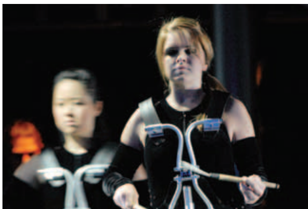
The 47 members were selected from among more than 1,000 candidates going through auditions across the USA.