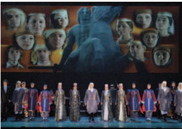
Cairo Opera House Arab Music Ensemble

On 24 stages in 12 major cities across Japan from May through June in 2009, Min-On introduced distinguished artists from Greece, the origin of his expedition; Egypt, where the first utopian city of Alexandria was built; and, Uzbekistan, where another Alexandria, the furthest north in central Asia, is located. The collaboration of their music and dance performances were his dream come true.