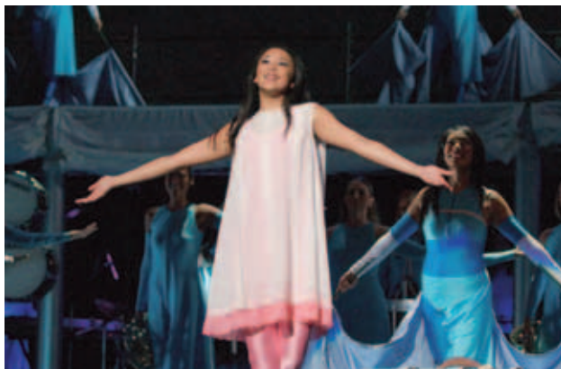
The story begins with that a young girl sets out on a journey.