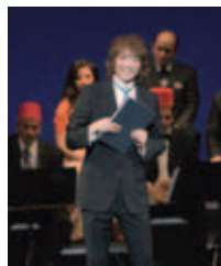
Master of ceremonies for "The Path of Alexander the Great"

It is a privilege to be able to put on these wonderful performances in Japan. Each day I feel such anticipation, it's as if my heart is humming.