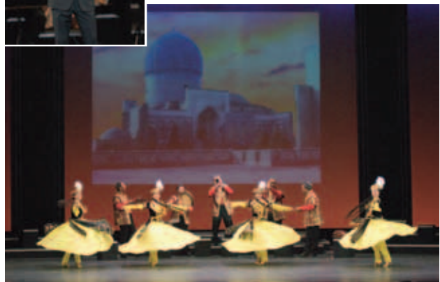
Artists from "The Path of Alexander the Great" appearing for a curtain call