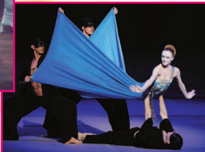
"The Little Mermaid"