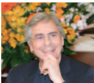
Artistic Director, the Hamburg Ballet Professor John Neumeier

John Neumeier was born in 1942 in Milwaukee, Wisconsin, U.S.A. After he progressed to solo dancer and created his first choreographic works at the Stuttgart Ballet, he was appointed as the Director of Ballet in Frankfurt in 1969. Since 1973, he has been Director and Chief Choreographer of The Hamburg Ballet, and since 1996, he is the "Balletintendant." Under his direction, The Hamburg Ballet became the leading ballet company on the German dance scene and received international recognition as a marvelous ballet company led by one of the most eminent choreographers in the world. The Min-on Concert Association, since 1986, has invited The Hamburg Ballet for six tours in Japan.