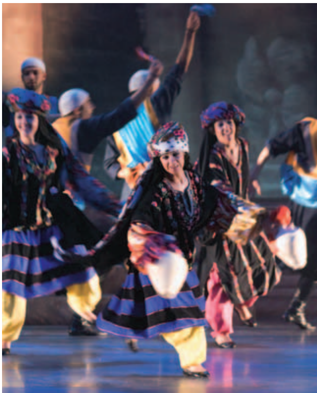
Traditional celebration of the wedding