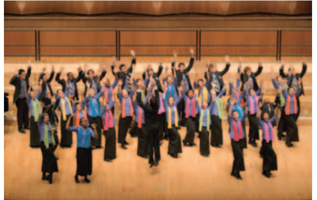
Choir members display their explosive joy of performance