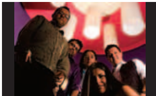
From Costa Rica