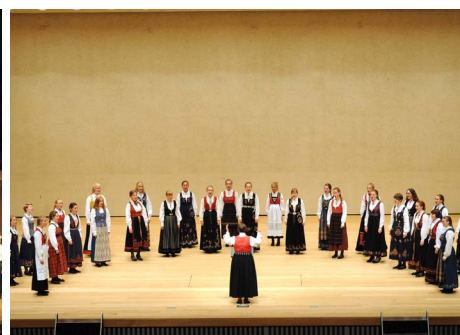
The Norwegian Girls' Choir from the Kingdom of Norway, 2014