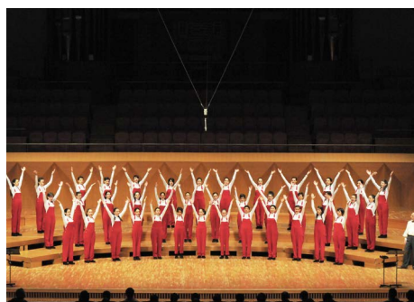
The Little Singers of Armenia from the Republic of Armenia, 2012