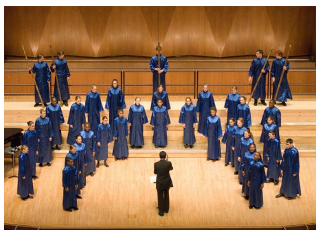
The Young People's Chorus of New York City from the USA, 2009 & 2010