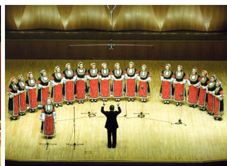
The Philip Koutev Choir of Bulgaria from the Republic of Bulgaria, 2007