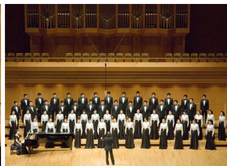
The Red Star Chorus of China from the People's Republic of China, 2009