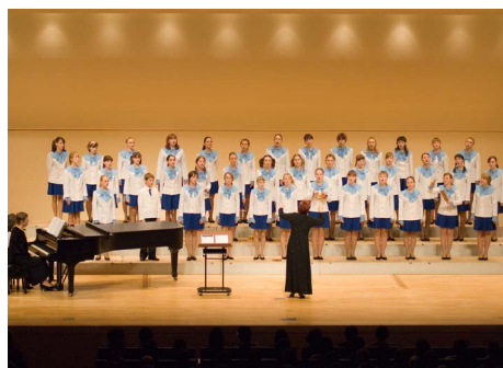
Sveshnikov Children's Choir of Kolomn from the Russian Federation, 2008