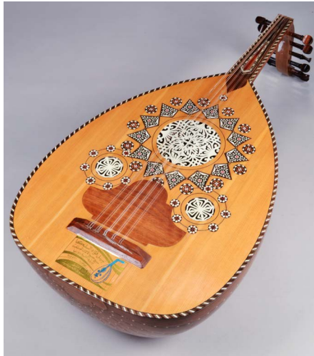
Oud — Chordophone

Chordophones are instruments in which the source of vibration is stretched strings to produce sound. The rich wisdom and creativity of each instrument from countries representing a diverse array of ethnic, linguistic and religious traditions are on display at the Min-On Museum.