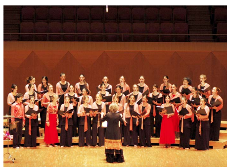
The Efroni Choir of Israel from the State of Israel, 2006