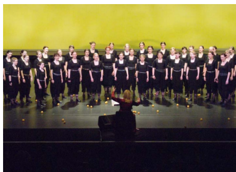
Carmina Slovenica Women's Choir from the Republic of Slovenia, 2008