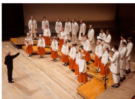
The Riga Chamber Choir "Ave Sol" from the Republic of Latvia, 2004

Min-On initiated the World Choral Music Series in 1970 with a Japan tour by the Men's Chamber Choir of Bulgarian Radio and Television from Bulgaria, a country known as a "Kingdom of Choruses." Since then, Min-On has invited over 30 of the finest choirs from all over the world, organizing over 600 concerts introducing world choral music to Japan. Each individual choir has a distinctive character showcasing a diverse repertoire. Through these chorus groups, almost one million audience members have been greatly inspired throughout Japan. Some of the choral groups invited in recent years are listed below.