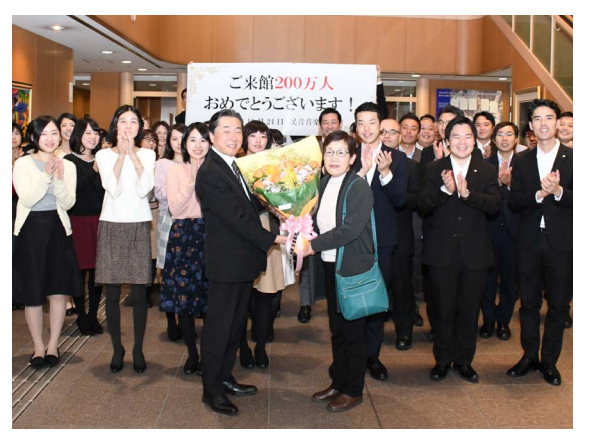
Two-millionth visitor welcomed at the Min-On Music Museum

Urbain: Indeed. Recent studies have proved the positive effects of music and detailed the development of methods, including music therapy, that improve people's health