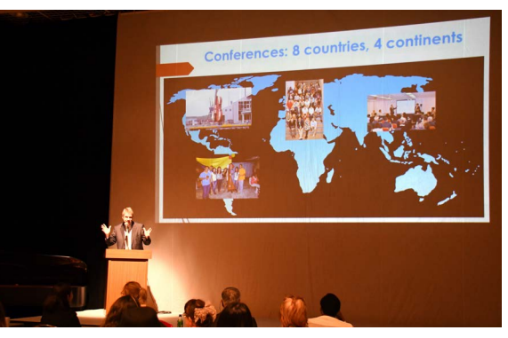
MOMRI Annual Report Confrence from October 19 - 22, 2017

society luxury beyond the reach of ordinary people. Under these circumstances, Min-On was born in 1963 to realize the Founder's vision of establishing a concert association unencumbered by excessive formality and financial burden. Since then, for 54 years to date, we have shared our founding principle with the volunteer members of the Min-On Promotion Committee and the thousands of Min-On Concert Association sustaining members: "The basis of genuine